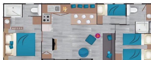
40m2 Mobil Home (2018)